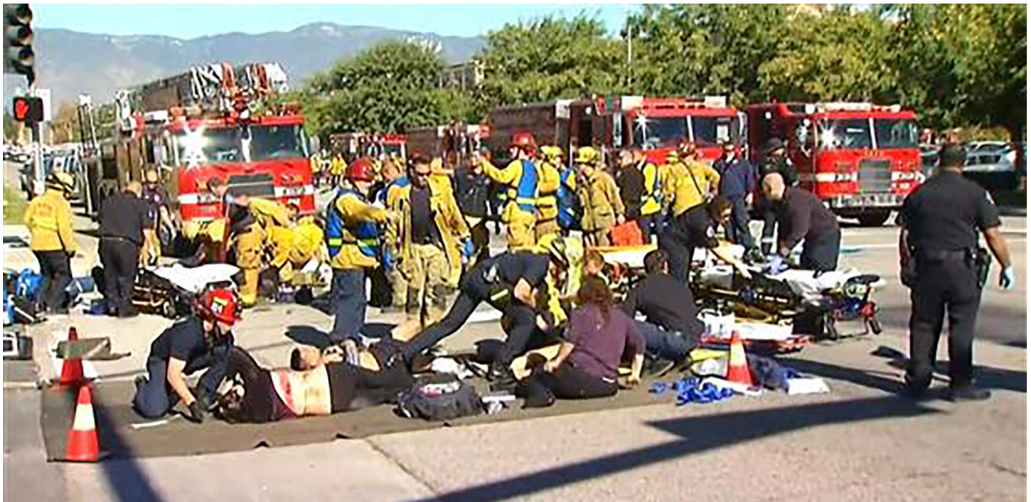
Figure 2. Casualty collection point.

conduit to both EMS and fire assets as well as providing operational input to the incident commander.